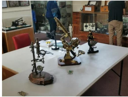
Photos from the museum